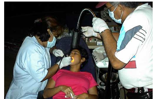
Evangelistic Medical Mission Crusades